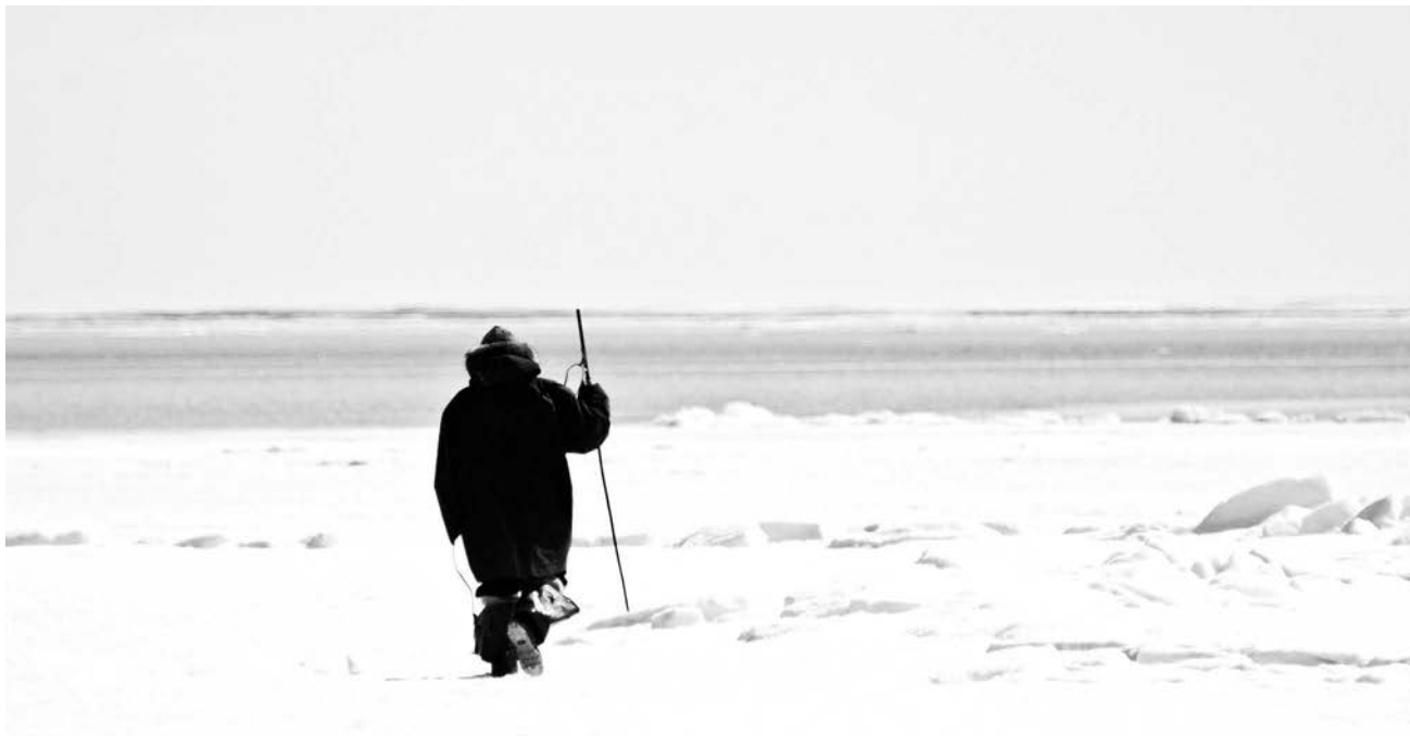
At the flow edge

This Public Guide will help you learn what you can do to get involved in Screening.