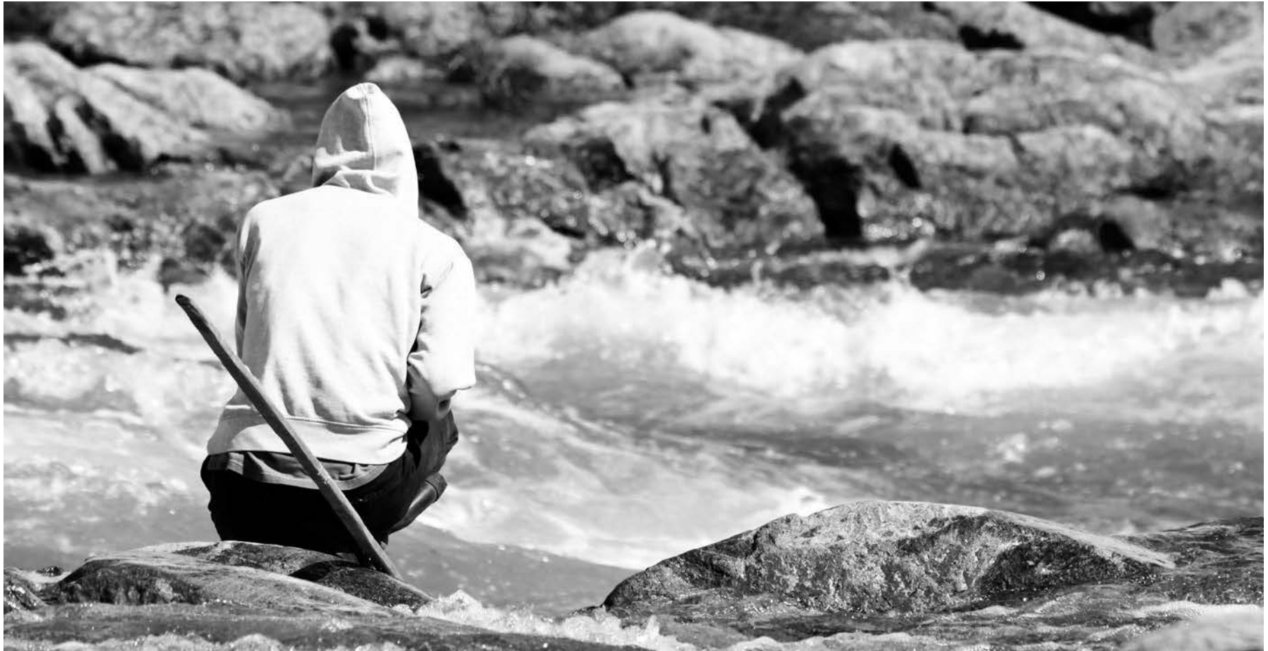
Fishing with a kakivak