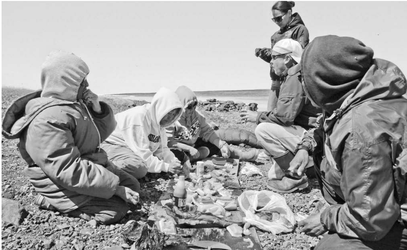
Inuit Qaujimajatuqangit day in Sanikiluaq

The NIRB puts a lot of emphasis on how a proponent has or will work with Inuit to incorporate Inuit Qaujimajatuqangit into their activities. For example, when discussing potential impacts to wildlife a proponent must extend that discussion to potential impacts on harvesting and communities. Proponents must demonstrate how they are integrating local knowledge and scientific knowledge into their project design to manage potential environmental and social impacts.